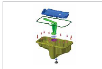
Oil Pan Product Integration

Dana's manufacturing capabilities include precision single- and multi-cavity thermoplastic injection molding, vibration welding, state-of-the-art assembly processes, and error-proofing machinery. Dana's experienced staff and in-house Coordinate Measuring Machine (CMM) department ensure a seamless production launch.